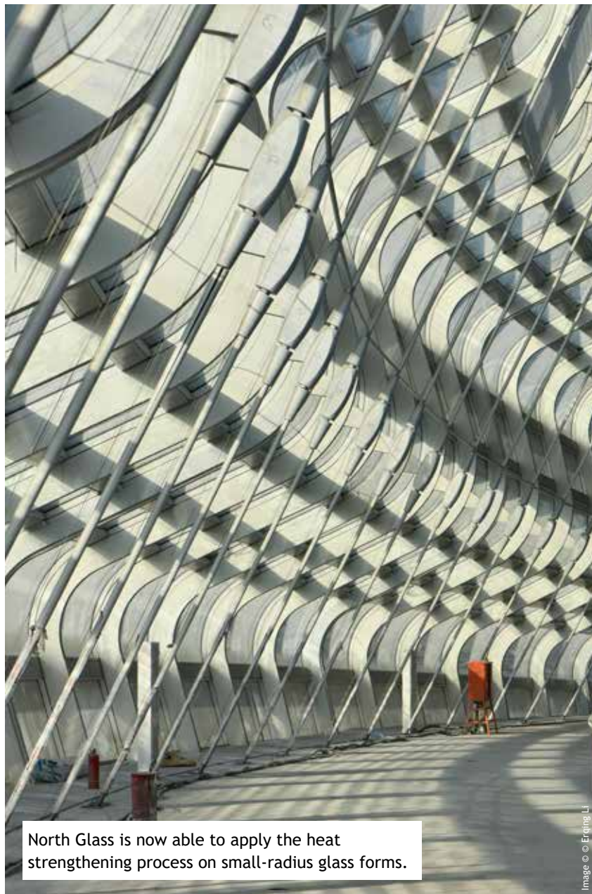
North Glass is now able to apply the heat strengthening process on small-radius glass forms.

Events such as the Olympics tend to push the envelope in terms of building designs and concepts, often acting as a proving ground for new ideas. Following these successful implementations, somewhat overly cautious architects start to become more receptive to what can be achieved with glazing and interlayers and we are starting to see the new concepts drip-feed into other projects around the globe.