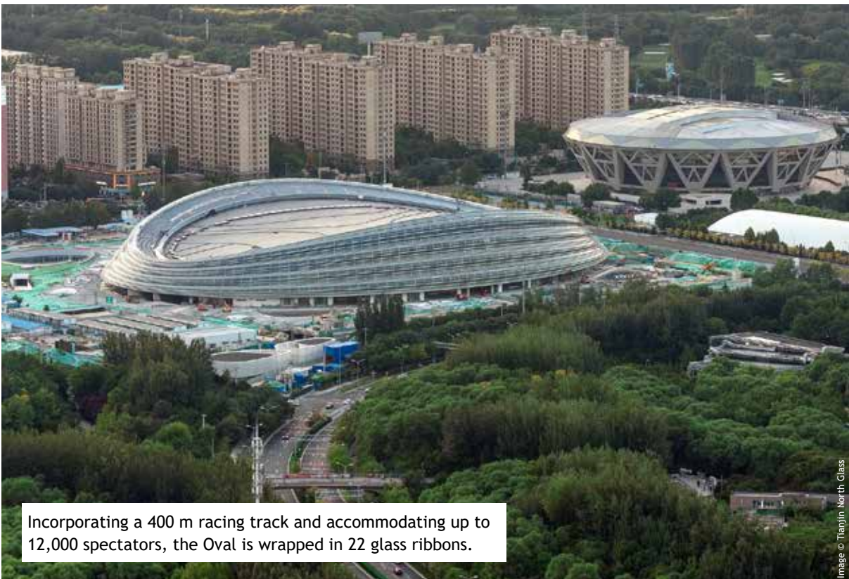
Incorporating a 400 m racing track and accommodating up to 12,000 spectators, the Oval is wrapped in 22 glass ribbons.

Incorporating a 400 m (1312 ft) racing track and accommodating up to 12,000 spectators, the 240 x 180 m (787 x 590 ft) Oval is cocooned or wrapped in 22 glass ribbons, which swoops around its external envelope from ground level up to its 34 m (111 ft) high roof. Designed to look like ice and to impart a sense of speed, the ribbons are manufactured from highly transparent low-iron glass in insulating glass units (IGU), all of which are laminated using the SentryGlas® ionoplast interlayer from Trosifol. The wrap effect is particularly striking at night, where the optically clear ribbons become almost dynamic thanks to an array of lighting effects.