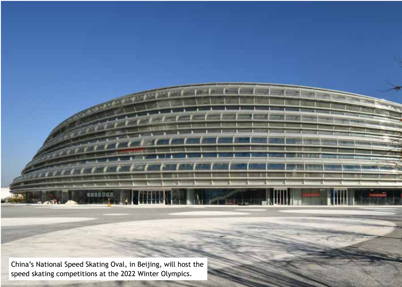
China's National Speed Skating Oval, in Beijing, will host the speed skating competitions at the 2022 Winter Olympics.

The façade totals some 30,000 m 2 (322,917 ft 2 ) and is formed of 3,484 different glass panels. The panels vary in their composition depending on their form. The flat IGUs comprise an outside lite made from 8 mm (0.3 in) glass + 1.52 mm (60 mil) SentryGlas® + 8 mm glass with a low-E coating on surface 4, a 12 mm (0.5 in) Argon-filled air gap separates this from the inside lite, which comprises 8 mm glass + 1.52 mm SentryGlas® + 8 mm glass. All glass is low iron. The curved IGUs have the same layered format but differ by their use of 2.28 mm (90 mil) SentryGlas®. The maximum panel length is around 4,100 mm (161 in), the maximum arc length is 2,400 mm (94.5 in) and the minimum bend radius is 1,500 mm (59 in).