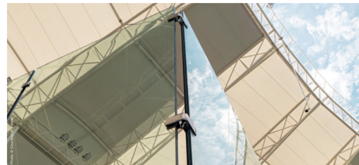
The balustrade panels are fabricated from 10 mm fully tempered glass + SentryGlas® + 10 mm fully tempered glass

Early in the design phase, a circular layout was chosen for the stadium on the 20-hectare site, not only to represent the sun – an element in the province's coat of arms – but